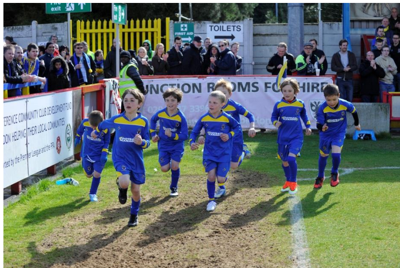
Tomorrow's players making a lap of honour in front of the fans

5.3.3. All this investment is beginning to bear fruit: in 2013/14 the Club is enjoying the most successful start to a season in the Football League and has made record levels of season ticket sales.