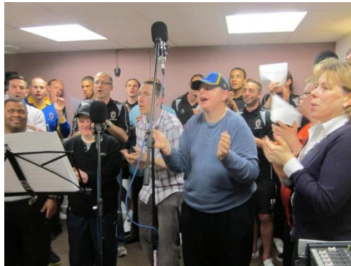
The big blast band with players in the recording studio