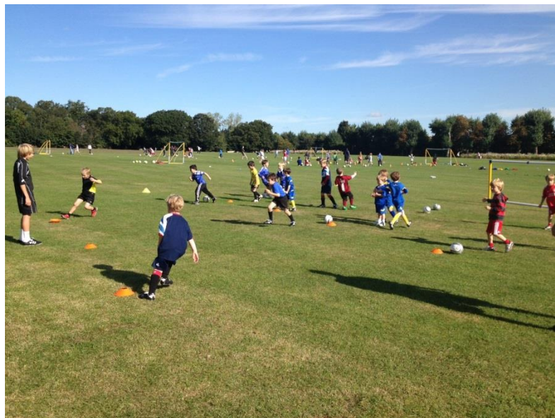
Saturday morning football coaching for local youngsters