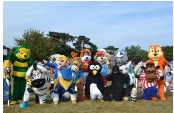
The ‘Chariots of Fur’ AFC Wimbledon mascot charity race